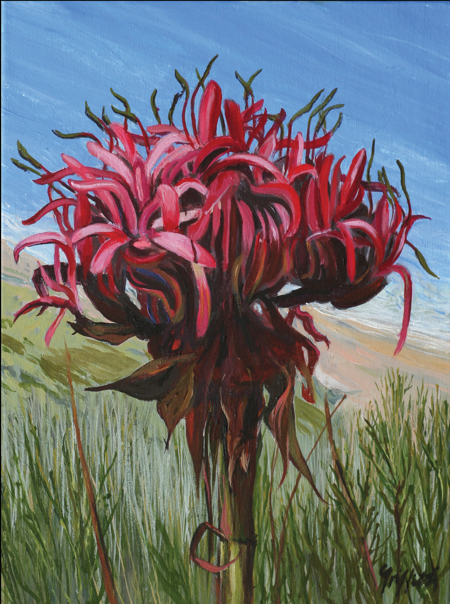
PAMELA GRIFFITH GIANT LILY, (DETAIL) ACRYLIC ON CANVAS, 41.0 X 32.0 CM

Task: Pamela Griffith likes to paint flowers that are unique to our area. This is a painting of a Gynea Lily. Now let's make our own flower out of the following materials. This activity is best to do with an adult.